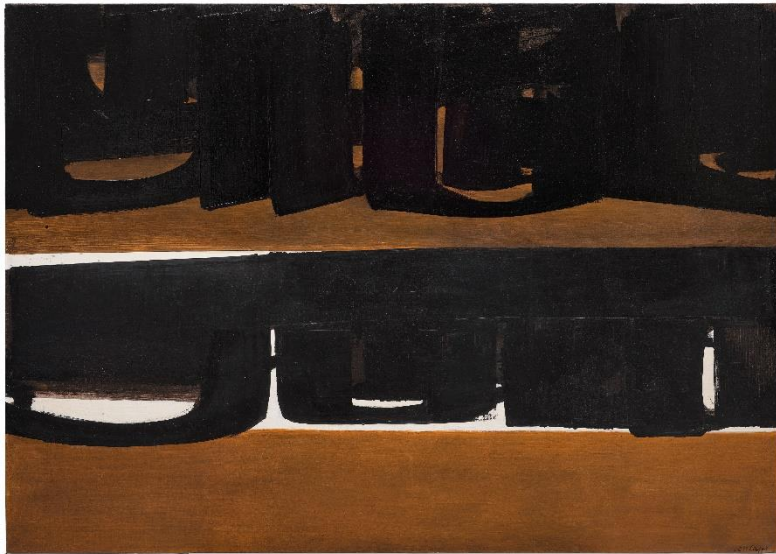
Pierre Soulages (né en 1919), Peinture 143 x 202 cm, 4 décembre 1970, estimate: EUR 1,500,000–2,000,000

Paris and London – On 28 June, the 20/21 London to Paris sale series returns after the huge success of previous editions. Celebrating the cultural dialogue between Paris and London, the season offers a broad selection of 20th and 21st century art, including exceptional collections and remarkable masterpieces.